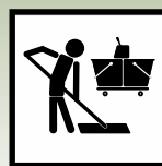
Applicable for surface disinfection