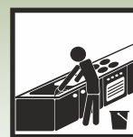
Also suitable for food processing facilities